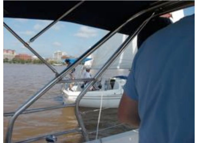
Sailboat racing results in boat to getting close to each other