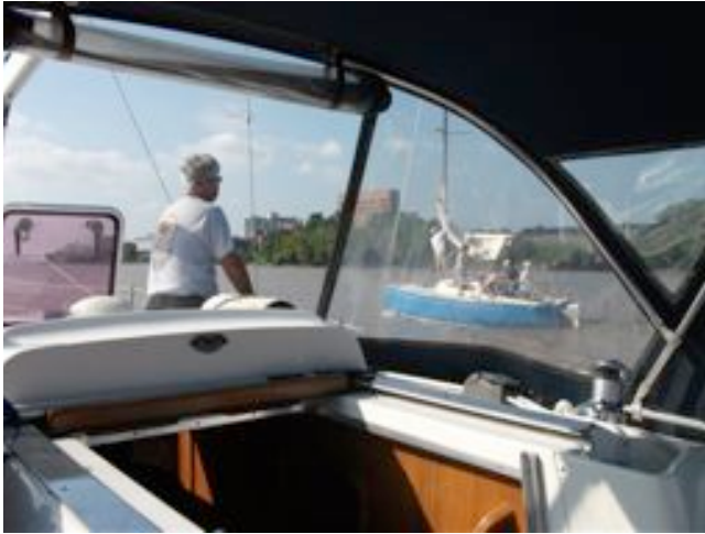
One of our adult leaders, Carl Darron, on the "PIXIE DUST"

We are still recruiting youth and adult leaders. I can be reached at (540) 720-0929 or coastiewm99@hotmail.com for more information. We also have a Facebook page at: Sea Scout Ship 212 and can be found on the Web at: http://groups.yahoo.com/group/SeaScoutShip212/