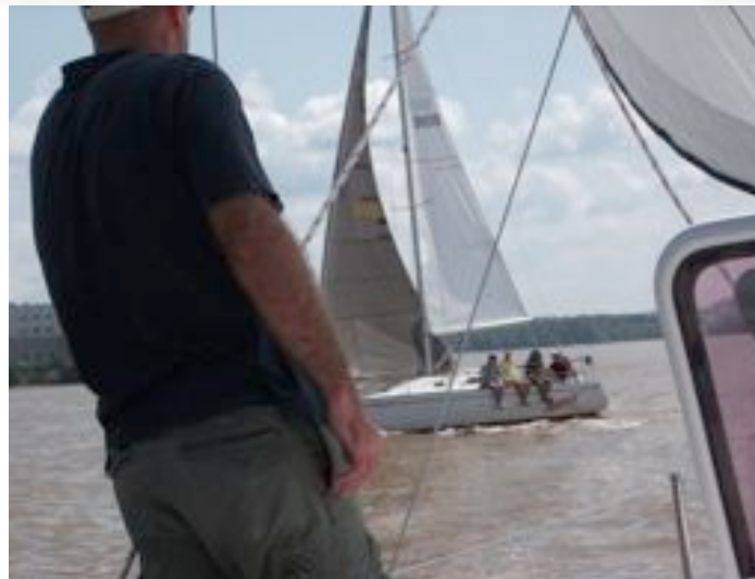
A view of another boat in the race from "PIXIE DUST"