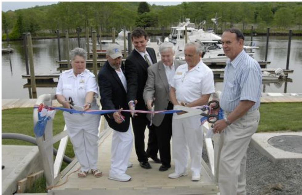
The ribbon cutting at the new marina

The board of Directors has established a special committee to look at all the options for a new business office and police station. Current construction estimates are much more than initially estimated. Everything is on the table from rebuilding on the current sites to moving to an open lot to taking over a foreclosed home. A consolidated building on the current business office site is also a consideration.